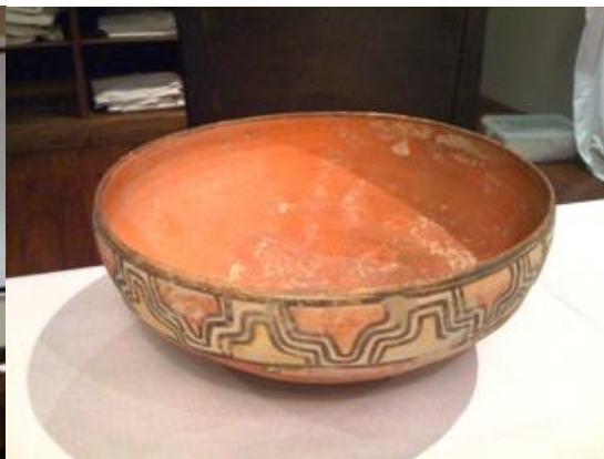
2,800 year old bowl from the Indus Valley.